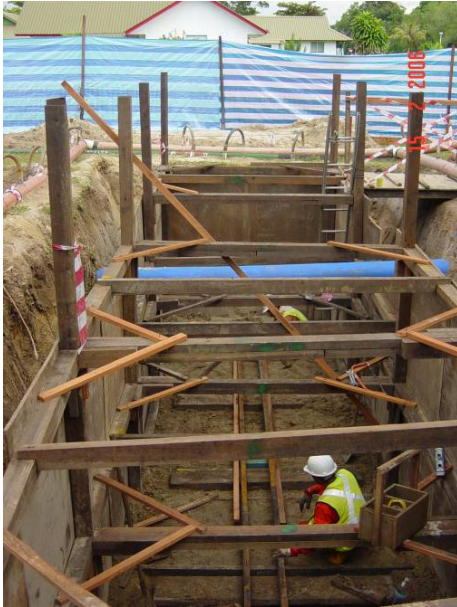
Photo 4: A view of the shoring completed at the Entry Pit. Workers were aligning the improvised rail to the Exit Pit.