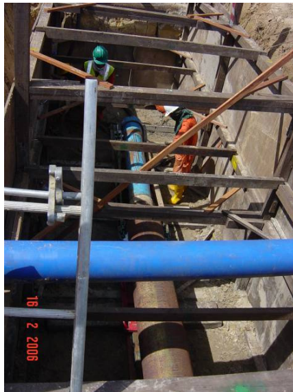
Photo 8: A view of the shoring at the Entry Pit with the Grundoram Gigant hammering in the Ø400mm steel pipe.