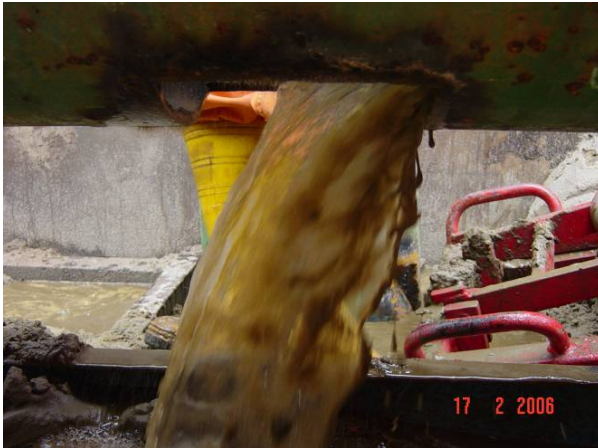
Photo 12: Water, together with sand in being washed out through the bottom hole on the steel pipe.