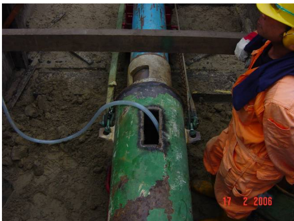
Photo 11: Water is inserted through the top hole on the steel pipe while ramming in the steel pipe.