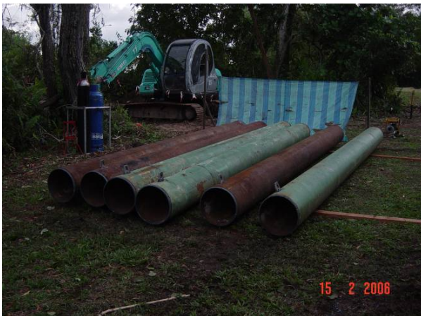
Photo 6: Six steel pipes, each about 6m, were used to cover the ramming distance of 32m.