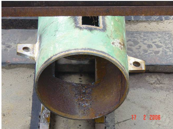
Photo 9: Two holes were cut, one above and one below, to allow water to wash out the spoils within the steel pipe while ramming.