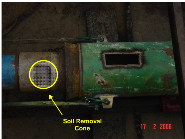
Photo 10: The hole in the soil removal cone is mostly blocked by the Grundoram Gigant. The spoils in the steel pipe cannot escape easily which caused the sand inside to be very compacted.