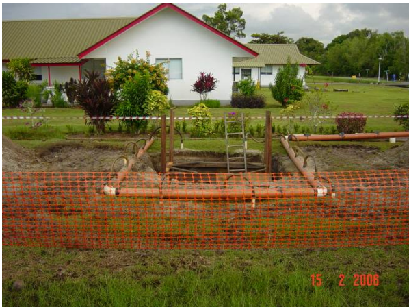
Photo 5: A view of the Exit Pit, just in front of the Fire Station.