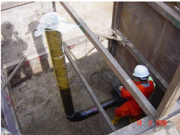
Photo 14: A view of the GRE pipe successfully inserted through the steel pipe.