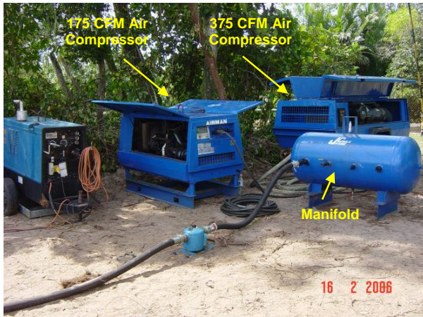
Photo 7: One 375CFM air compressor was combined with one 175CFM air compressor using a manifold to drive the Grundoram Gigant Hammer.